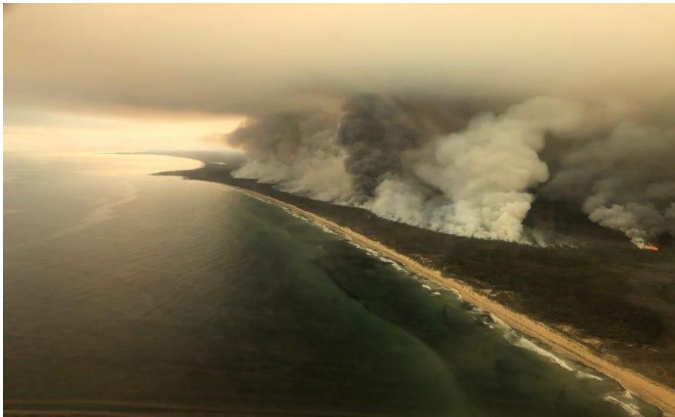
Fig.3: In the picture, plumes of smoke appear soaring from the devastating wildfires that emerged in Victoria, on the coast of East Gippsland. It depicts the magnitude of the air pollution which was caused by the series of bushfires in 2019 and had terrible

A significant number of businesses were shut down, because of the wildfires' impact on their property. For example, farmers at the areas where firespots occurred faced serious economic problems since rural places such as farmlands were immediately devastated, with the exception of some areas where Aboriginal Techniques were drastically implemented. 68