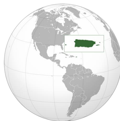
Figure 1: Location of Puerto Rico

This means that Puerto Rico lacks a lot of the basic freedoms of a sovereign nation, such as self-determination and a fully independent cultural identity which, while it is distinct in many ways, is heavily influenced by American culture. Due to its lack of statehood, Puerto Rico does not have