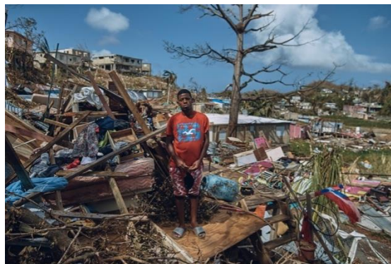
Figure 3: Aftermath of Hurricane Maria [3]

On September 20 th , 2017, the Category 5 Hurricane Maria struck the island, causing devastating damage and killing over 3000 people in the process and plunging the entire population into a severe humanitarian crisis 16 . Following shortly after the storm, the entire island lost power for multiple days, with access to clean water and food becoming scarce. Roughly 80% of the island nation's agriculture was destroyed, reaching an estimated economic deficit of $780 million USD.