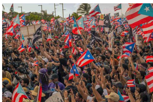
Figure 2: Protests in Puerto Rico 13

Unfortunately, corruption is one of the key issues that plagues the Puerto Rican government. The most recent example of this took place in July of 2019, with the ousting of Governor Ricardo A. Roselló, along with the arrest of six other government officials. His resignation was a result of popular uprisings, with hundreds of thousands of Puerto Ricans