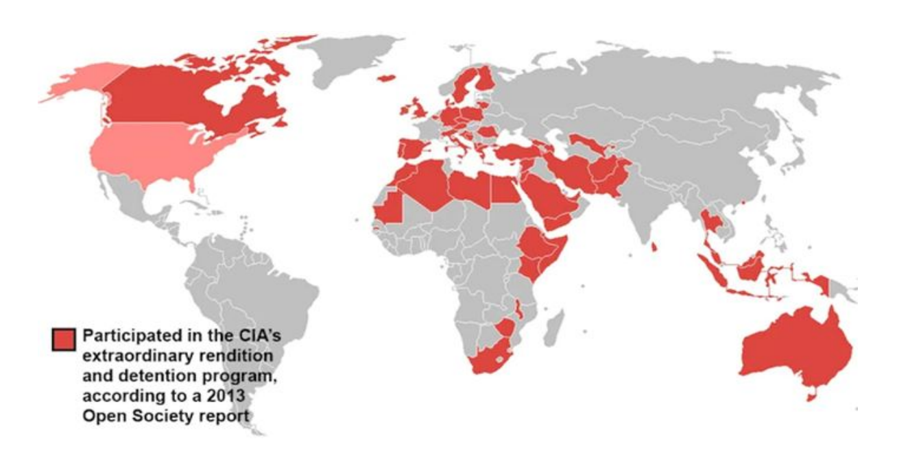
Chart by Max Fisher showing the countries cooperating with the CIA in the 9/11 investigation 13

when carrying out brutal investigations in order to avoid condemnation from national law.