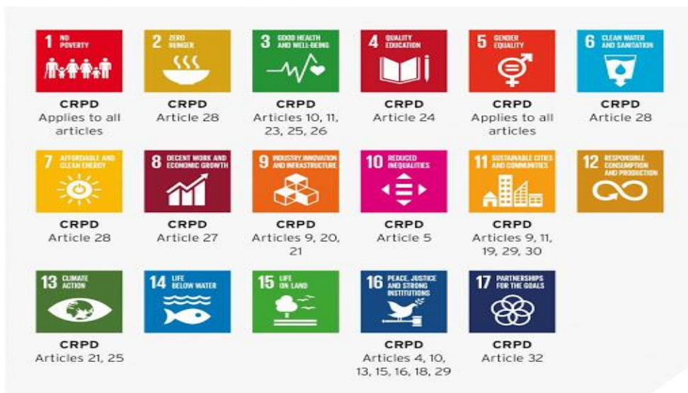
Figure 1 - Link between the SDGs and the CRPD

As it was previously defined, SDGs are eight goals/issues that should be tackled by 2030, to succeed a better and sustainable future for all, including minorities like the disabled. They were adopted in 2015 by all Nations. The SDGs focus on ending poverty, hunger, equality and create sustainable cities and communities (among others).