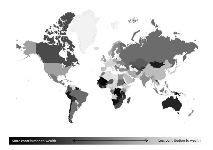
Figure 4 shows a map of the countries where mining contributes more to wealth is in black and the ones where mining contributes less are shown in a lighter grey.

Areas where mining has positively impacted their economy are Central Asia, Southern, Western and Central Africa, Oceania and South America. The regions shaded in grey where mining contributes less to their economy are Western Europe, North Africa and the Middle East, Japan and some countries in South Asia.