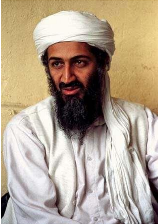
Figure 2: Depicted is Osama bin Laden, the founder of Al-Qaeda (1957-2011)

attacks against the United States, as well as for other actions of the past. In 2011, the leader of the organization was located and killed by the U.S forces and replaced by Ayman al-Zawahiri. Al-Qaeda has now evolved to a full-scale terrorist organization involved in many attacks, as well as kidnapping and hostage taking.